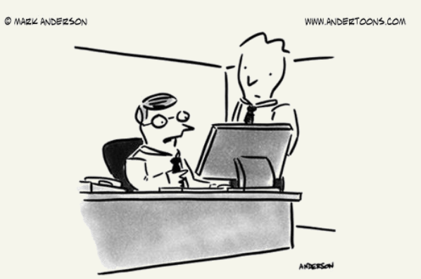
"I think I found the problem with your spreadsheet – it's a sudoku."

You are helping us keep up with you and that's what we want to do!